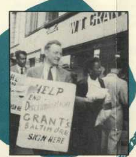
Picketing aroused community upport. Leaflets asked the public not to buy at Grant's and to protest to Grant's national office.

What method is behind this and similar CORE victories?