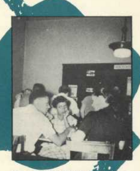
Demonstrations like this often on a larger scale, sparked the earlier dimestore campaigns.