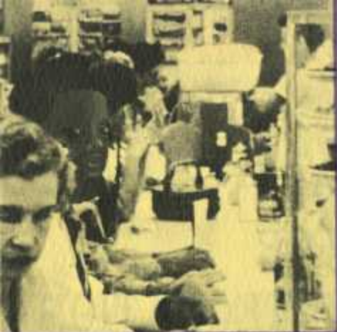
THE WAITING GAME . . . Negroes and whites sit at Miami lunch counter waiting for service. Several times, they have waited all day . . . in a spirit of quiet dignity and insistence on justice.