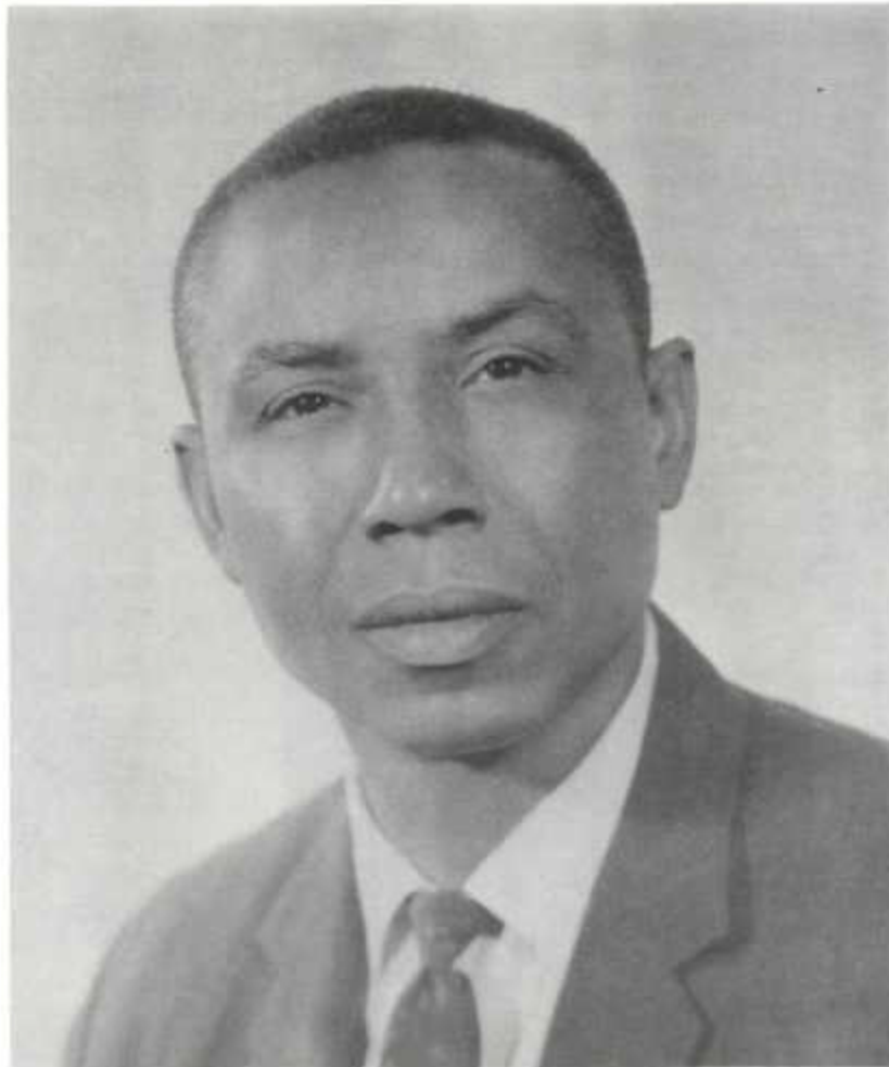
FLOYD Mc KISSICK, Esq.

We of CORE were overwhelmed with jubilation to learn that our governing body, the National Action Council had chosen Floyd Mc Kissick to fill the void that had come about with the news of the departure of Mr. Farmer. The anxiety, the emptiness that had momentarily besieged us was supplanted by new enthusiasm and hope for the future of our great organization. For in Floyd Mc Kissick are the sterling qualities that are uncommon indeed. A more erudite, judicious, inviolable and dedicated man could not have been found. He is an old warrior in the Civil Rights movement with an established history of militancy and deeply committed to the goal of total equality. CORE is blessed.