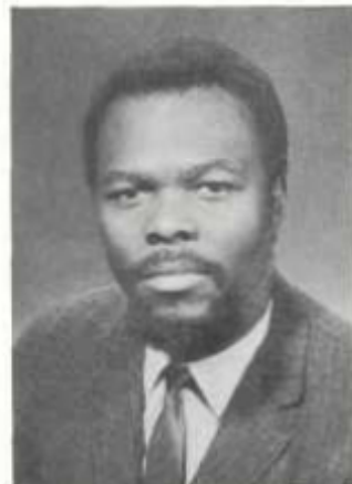
ROY INNIS Member-at-Large New York City