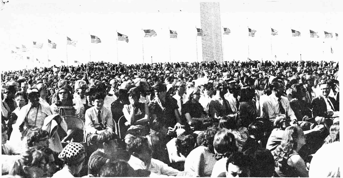
The March on Washington--April 17, 1965.