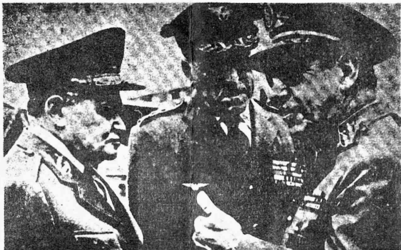
General Branco and fellow officers found by the US to be more acceptable rulers of Brazil than Goulart.